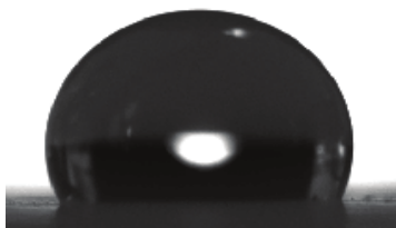
Water droplet on painted surface with SurfaPaint Aqua X Contact angle: 126°